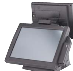
Sharp UP-V-9900L with a 12.1" Class (12.1" diagonal) customer display TFT Touch Screen LCD for exceptional clarity and enhanced customer experience; ideal for quick service restaurants, convenience stores or gas stations