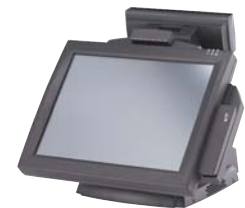
Sharp UP-V9900V with 2-line, 20 character VFD customer display screen; ideal for quick service restaurants, convenience stores or gas stations