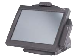
Sharp UP-V9900 base model without customer display; ideal for table service restaurants

Speed is also no problem, so even processing the most intensive applications is a breeze. Standard on every model, the UP-V9900 Series delivers 2.8 GHz of Intel® processing power and 512 MB memory (expandable up to 2 GB).